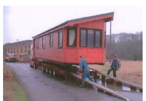
Fig. 4: method of delivery to site