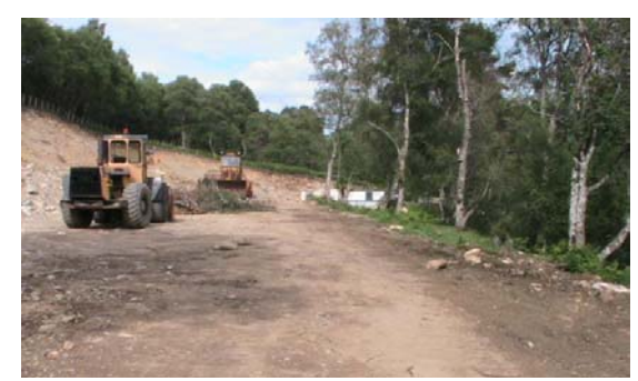
Figs 3 - 5: Excavated area of the proposed site

5. The ten chalets are proposed in a largely linear layout, with the majority of the gable fronts of the structures oriented in a southerly direction, to overlook the existing caravan park and afford views over Grantown on Spey and the wider rural area beyond. The site layout plan shows access to the proposed chalet locations being provided from two points. Access to the most northerly area of the proposed site would be via the existing access track which serves the area. The track at present is single carriage width, with an uneven surface and it winds it way up the hillside, sometimes at a significant gradient. It is proposed to create a road through the site, which would effectively traverse past the rear of the majority of the units, before leading downhill in the more southerly area of the subject site. The site plan indicates that the roads would be formed in compacted hardcore and it is also indicated that the ground in the vicinity of the road would be re-contoured in order to accommodate the road line.