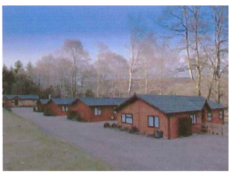
Fig.5 : Chalets in place at Erigmore Estate Leisure Park.

4. The ten chalets are proposed on an elevated site, which is approximately 15 - 20 metres above the ground levels of the existing campsite and comprises largely of a wooded bank. This area is part of the hillside which runs in an arc along the western fringes of Grantown on Spey and is covered almost in its entirety by woodland. Within the subject site, approaching the uppermost areas of the bank, a level area has been created by excavations, which have according to details provided on behalf of the applicants been undertaken between 1988 and 2004. In providing a history of the use of the area the re-opening of an existing borrow pit in 1988 is detailed. The borrow pit was reopened to provide material for site works in the caravan park. The excavated area was subsequently extended in 1991 in order "to create a storage area for old holiday home caravans" and was again excavated in 2004 in order to provide gravel for a new toilet block. It has been conceded in documentation that 21 birch trees were felled and removed at that time, and a further 5 or 6 decaying birch trees were removed from the area on the advice of a Caravan Club Health and Safety Inspector.