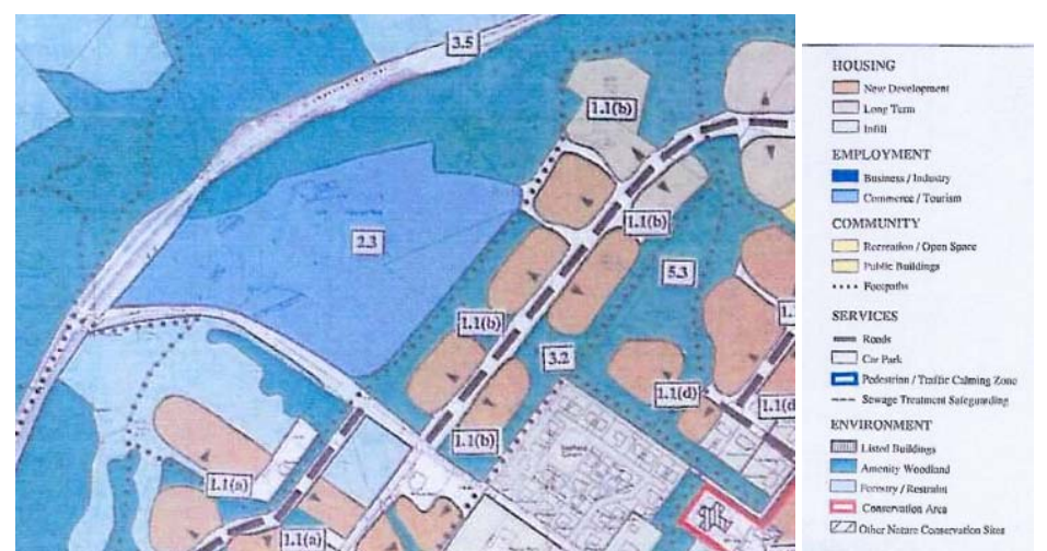
Fig. 9: Extract from the Badenoch and Strathspey Local Plan (1997)