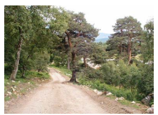
Fig. 6 & 7: existing access track serving the northern area of the proposed site.