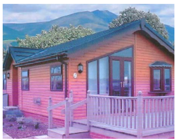
Fig. 3 : Extract from <u>www.westfield caravans.co.uk</u> showing the 'Cezanne' erected with brick basecourse

to the potential to incorporate a solid brick / block or timber basecourse in order to "remove any suggestions of a temporary building."