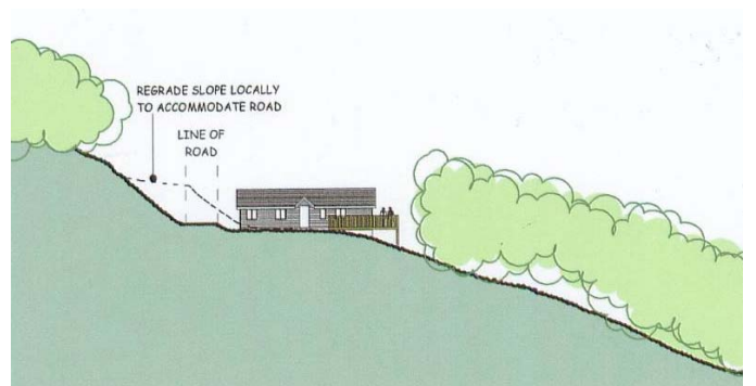
Fig. 8: Proposed site section

suitable for year round use, would fit better into the woodland location proposed and would allow the park to provide a more balanced range of visitor accommodation and consequently extend the operating season.